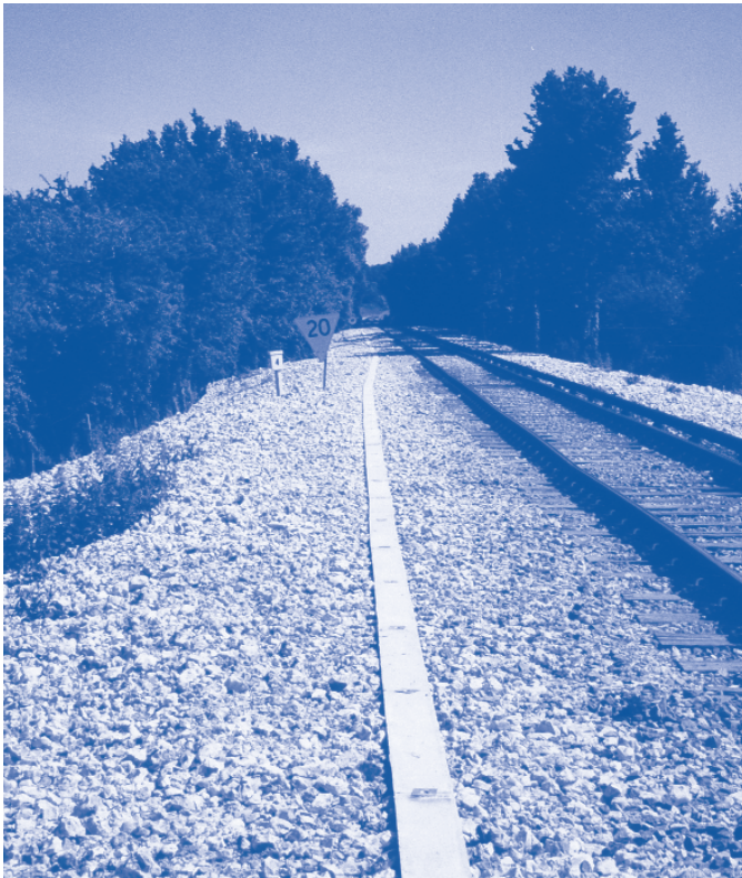
Wall thickness nominal 10mm

BCM ground cable channel is available in standard two metre lengths and in box sizes ranging from 100mm up to 350mm. Approximately one fifth of the weight of precast concrete yet strong enough to overcome the possibilities of breakage. The channels lightweight characteristics means that a four man team can install GRC channel at twice the speed of traditional concrete. Easier site delivery and movement to trackside also help cut time and labour costs.