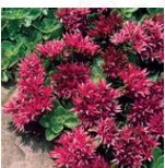
Sedum Spurium Coccineum Purple Carpe 15cm, dark pink flowers