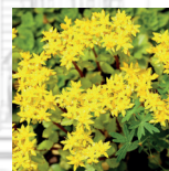
Sedum Acre Golden Carpet 6cm, yellow, mat-forming

Mixture: Light hand weeding every couple of months throughout the year to keep the wind-blown weeds at bay. Deadheading the removing the flowers are the end of the flowering period is a must to encourage new growth for the following year.