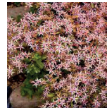
Sedum Stoloniferum Stolon Stonecrop 20cm, pink, star shaped flowers, red stems