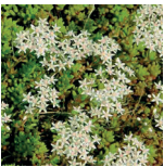
Sedum Album White Stonecrop 10cm, white umbel panicles