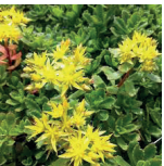
Sedum Hybridum Czars Gold 15cm, golden, rich flowering, reddish stems, ever green carpet