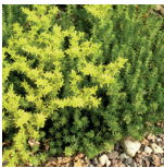
Sedum Sexangulare Tasteless Stonecrop 8cm, lemon yellow, dense sweet smelling foliage