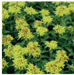
Sedum Kamtschaticum 10cm, small star shaped flowers