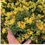
Sedum Floriferum Bailey's Gold 10cm, golden, evergreen, crenate foliage